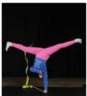
Cover: A grade II student is incorporating strength, flexibility, balance and coordination in her gymnastic class.